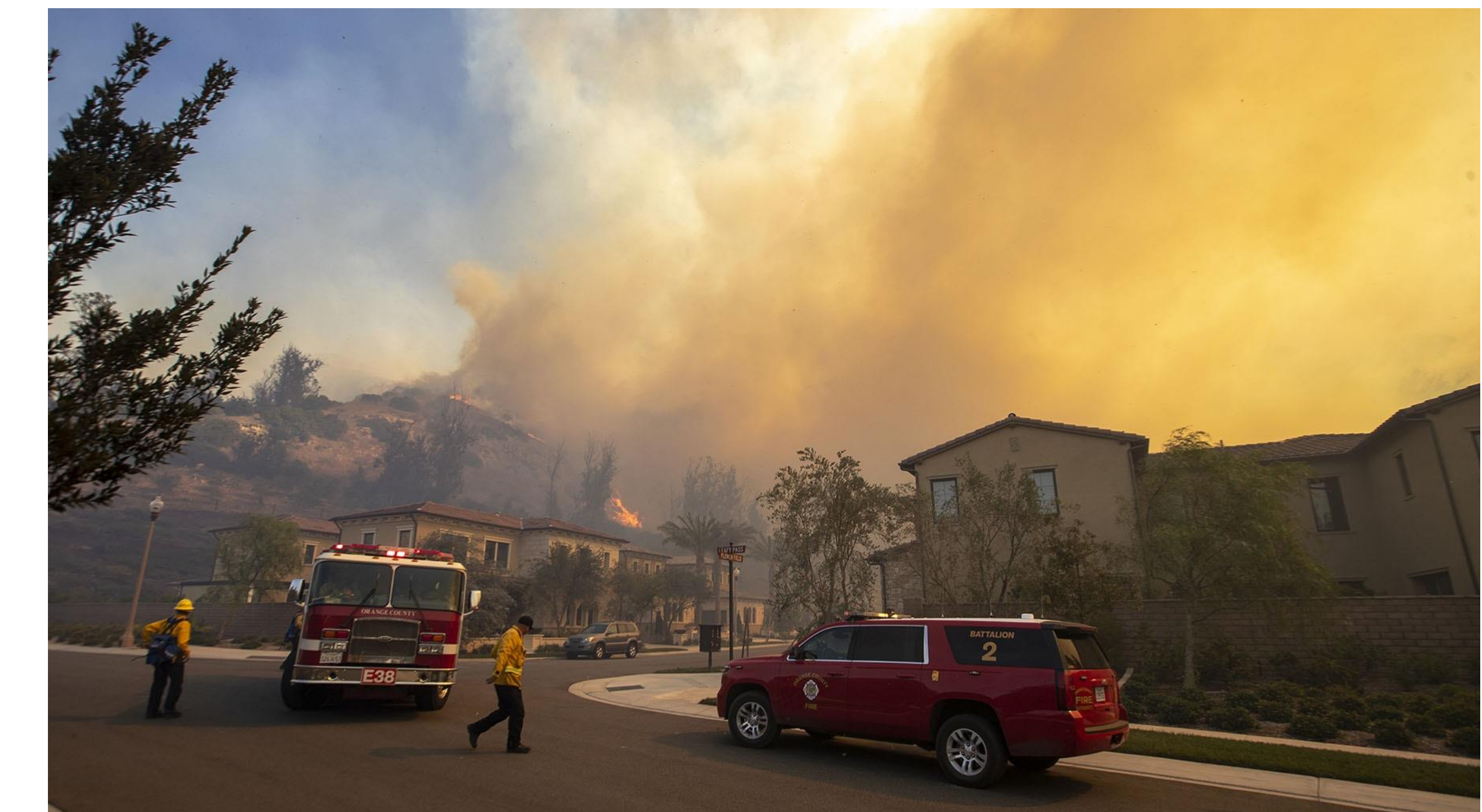
Orange County Fire Authority firefighters defend homes as Silverado fire approaches in Orchard Hills neighborhood